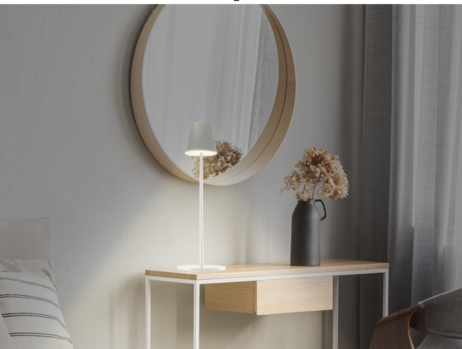
Rechargeable Sofa Lamp - White