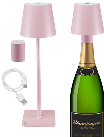
Rechargeable table lamp - Pink