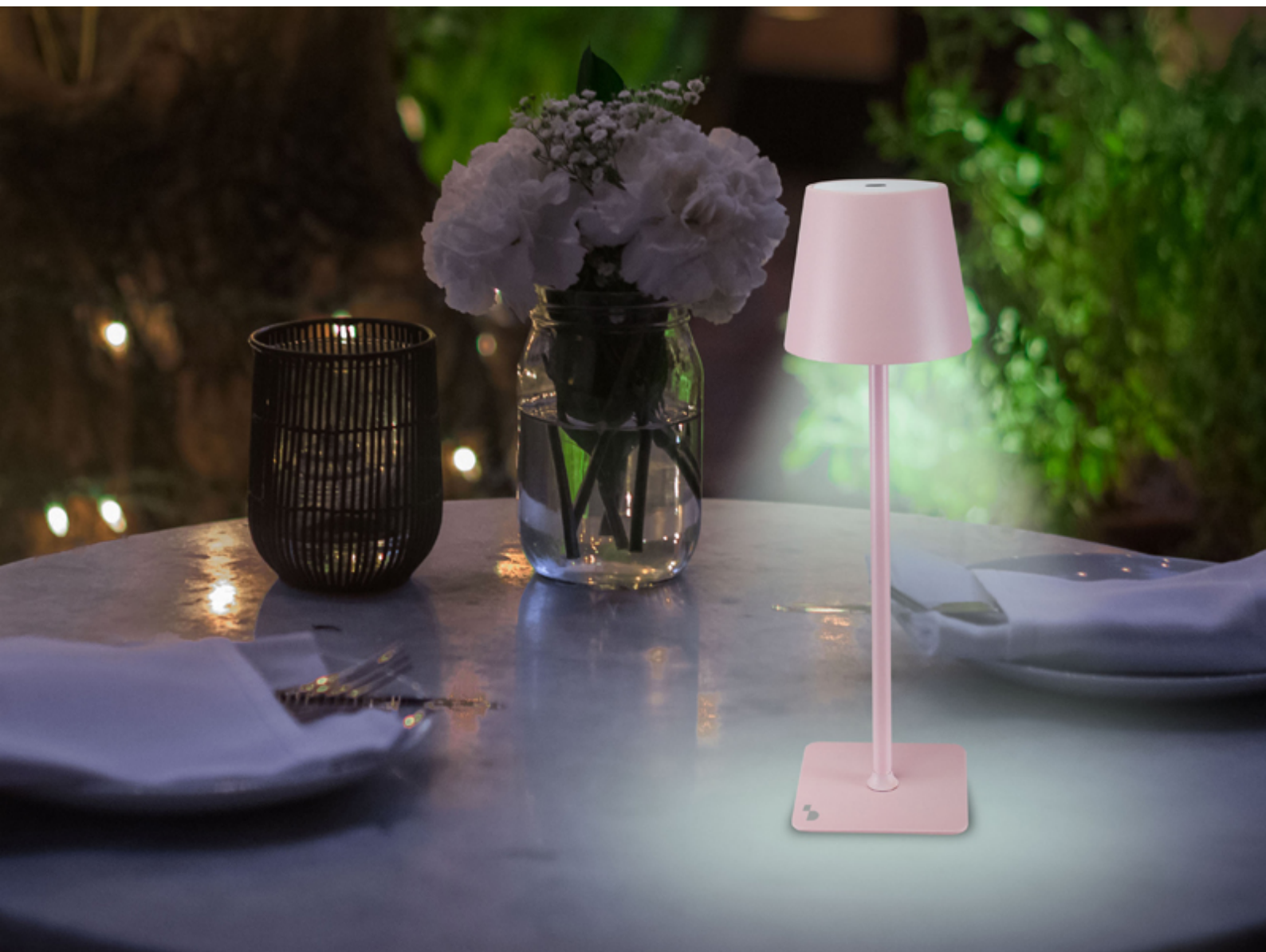
Rechargeable table lamp - Pink