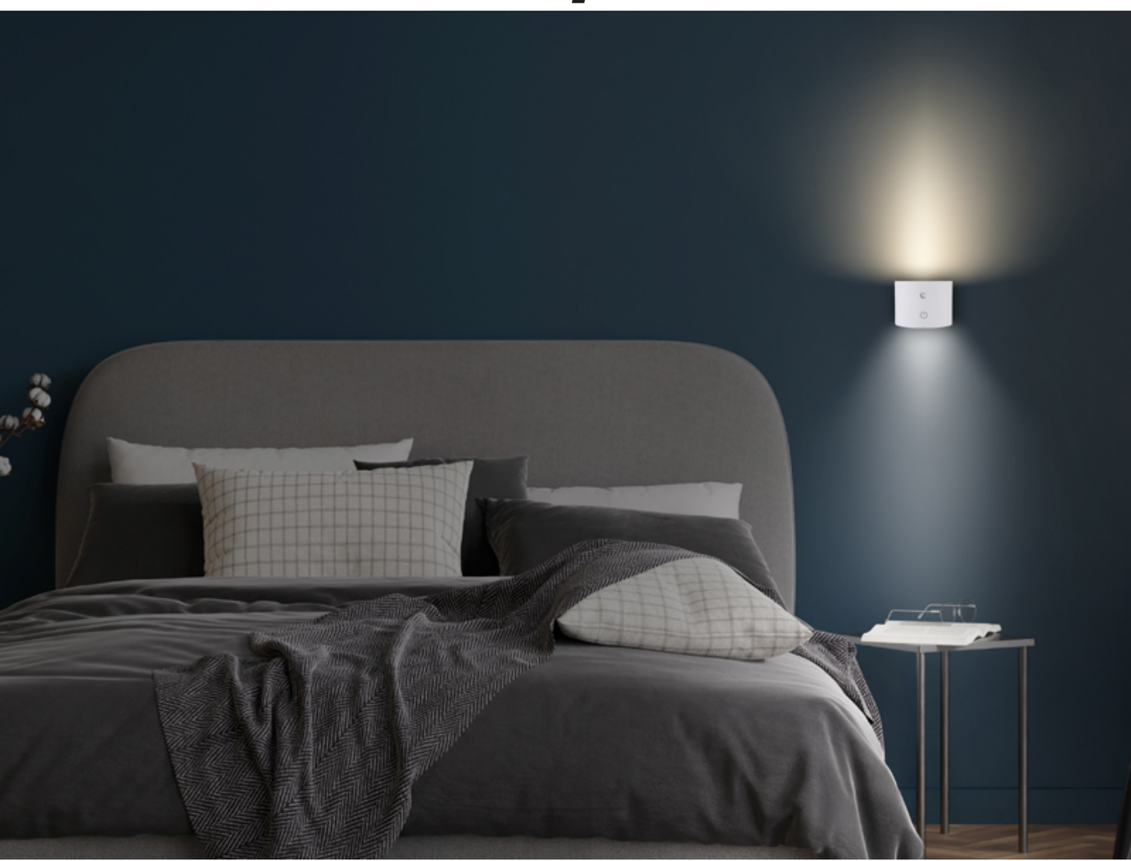
Luminì double-sided rechargeable lamp - White