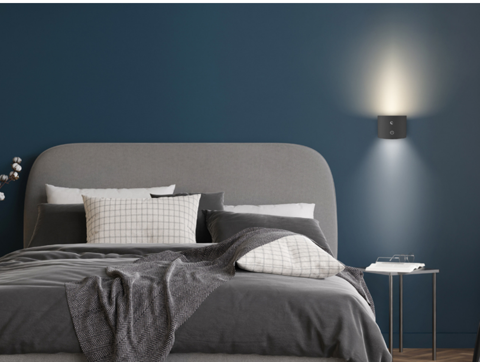
Lumini double-sided rechargeable lamp - Black