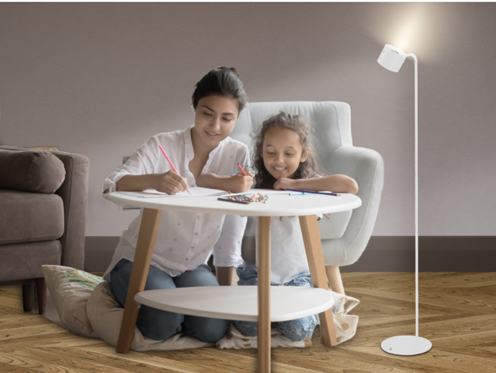
Lumì double-sided rechargeable floor lamp - White