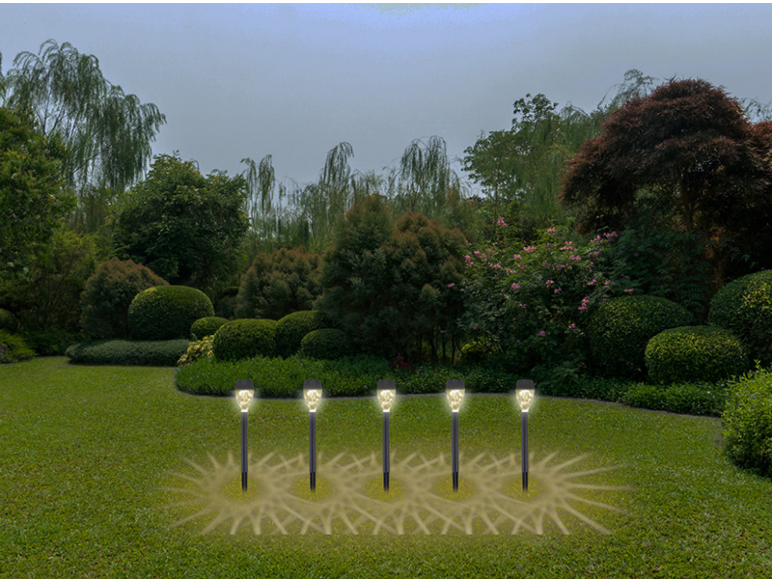
Set 5 Lume solar lamps