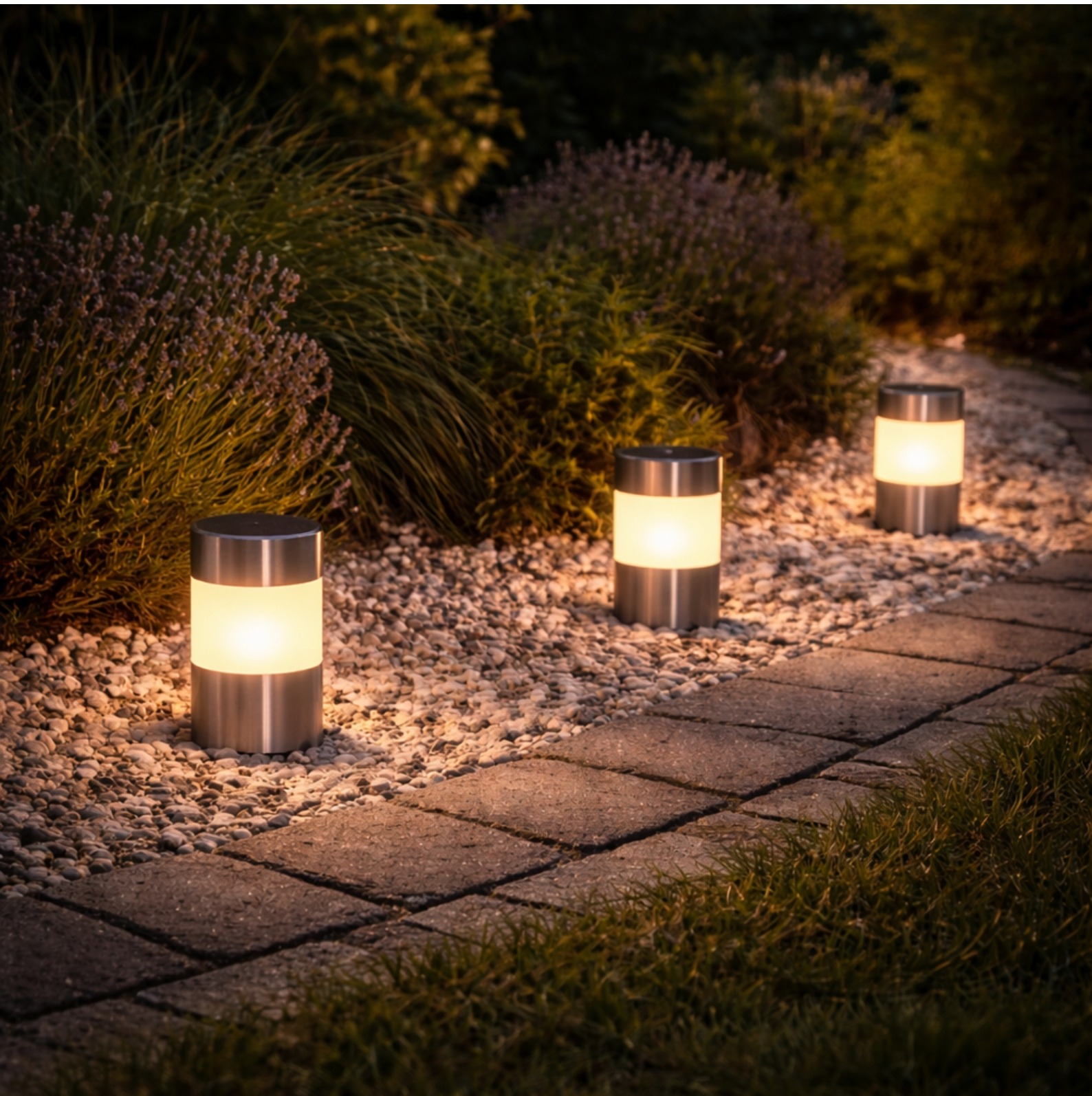
Set of 3 solar path lights SENTIA